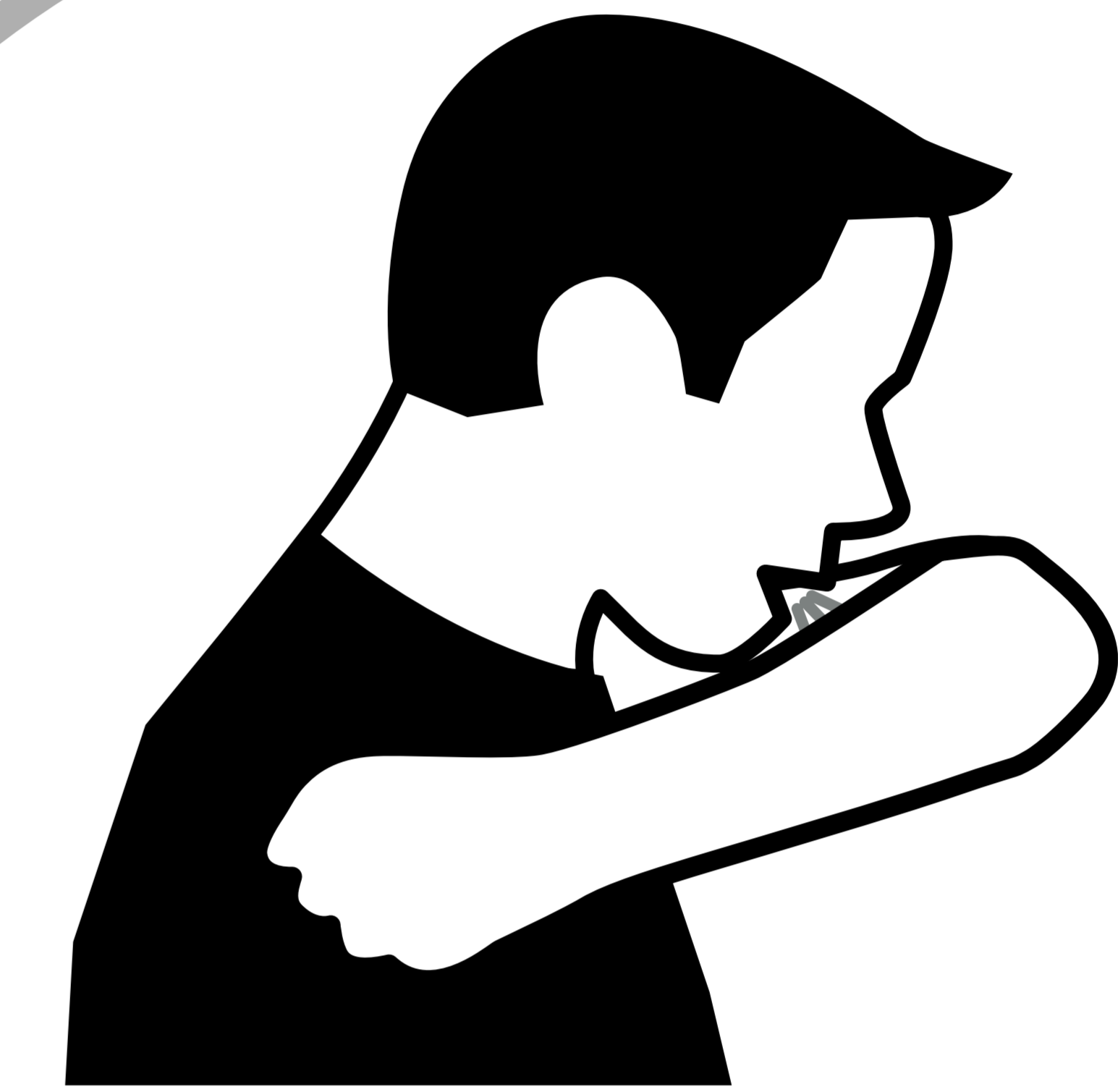
Cough Into Elbow