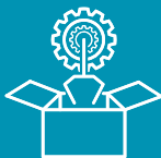
Equipment Sales + Service